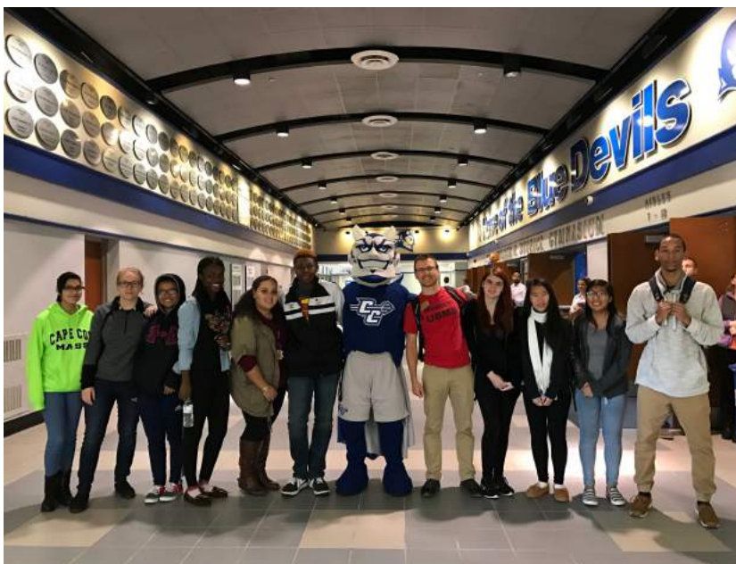
Students pictured with the CCSU mascot, the Blue Devil. Read about our college tours on page 2.

You can also visit our website at www.wesleyan.edu/ubms .