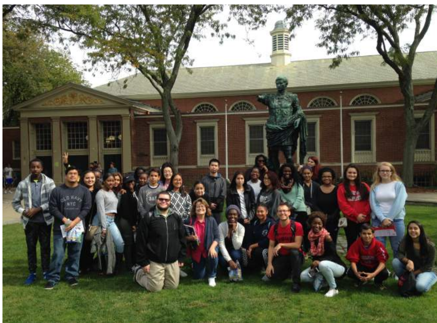
Students enjoying a tour of Brown University.

Throughout the summer and fall, we took our students to various colleges to expose them to different campuses. These trips included tours and information sessions with the admissions officers and current students. Visiting colleges and universities gives our students an opportunity to form personal connections with the schools. This can help make better decisions when applying to colleges. To the left are the colleges that students visited.